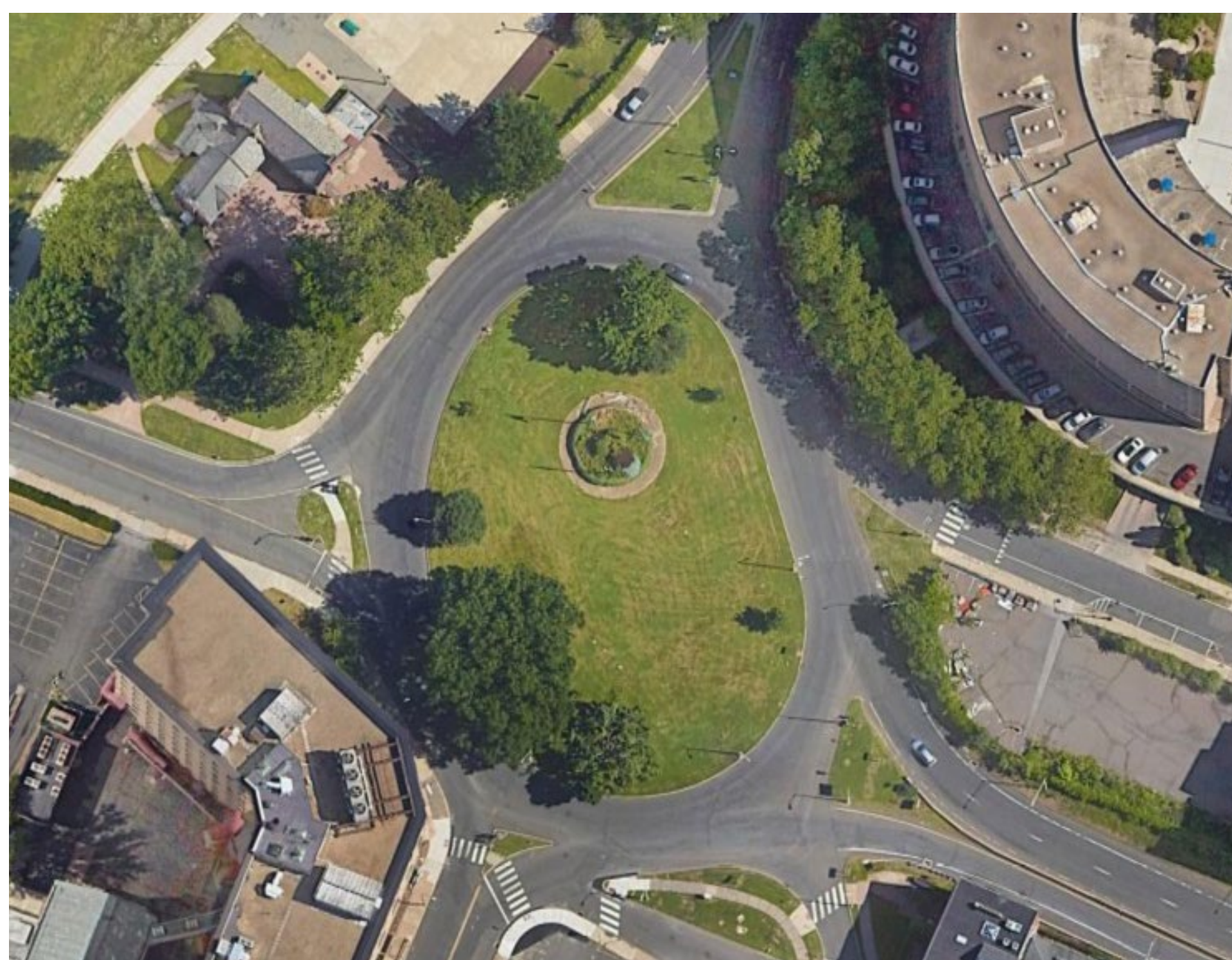
PULASKI CIRCLE IMPROVEMENTS