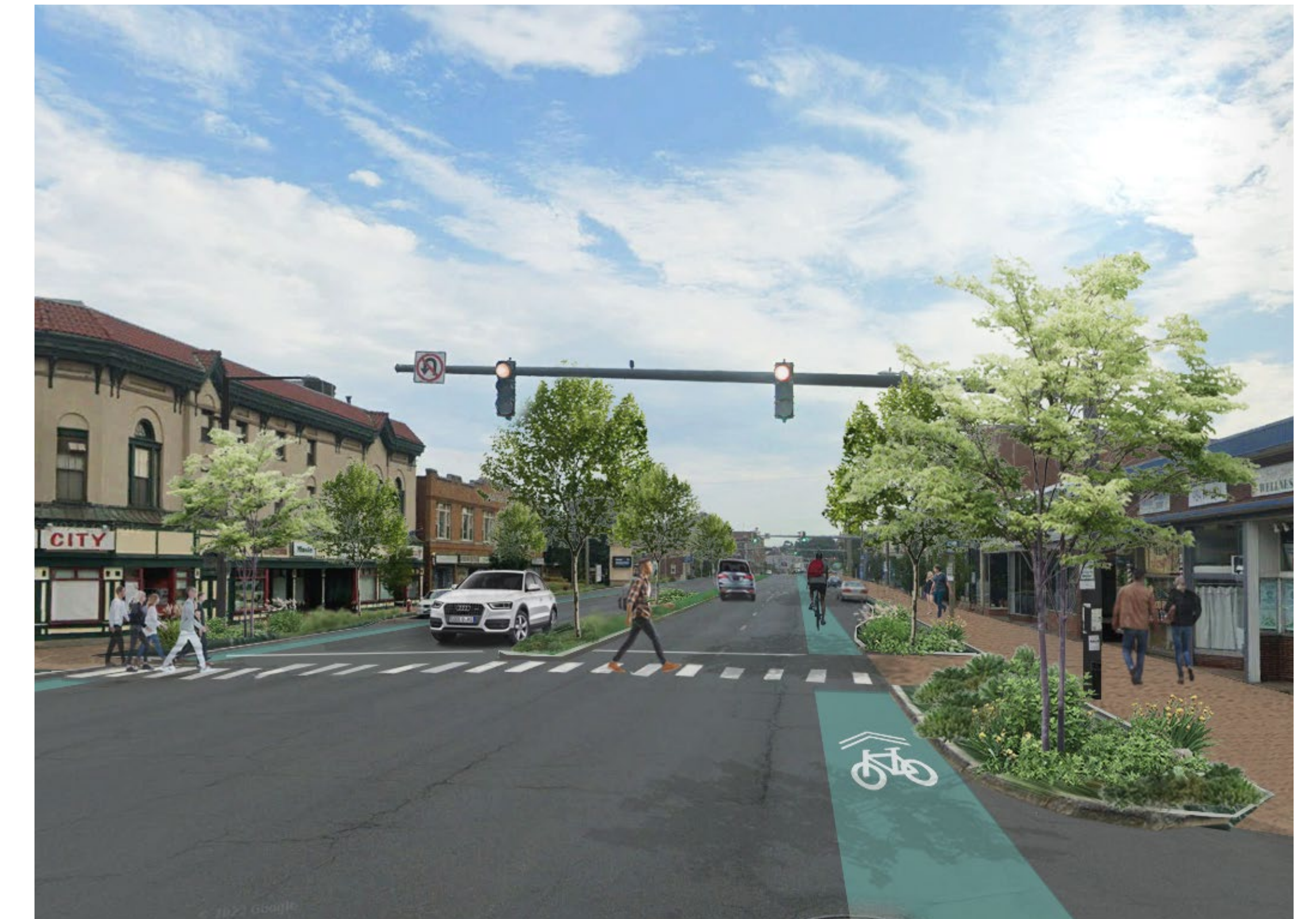
EAST HARTFORD MAIN STREET IMPROVEMENTS