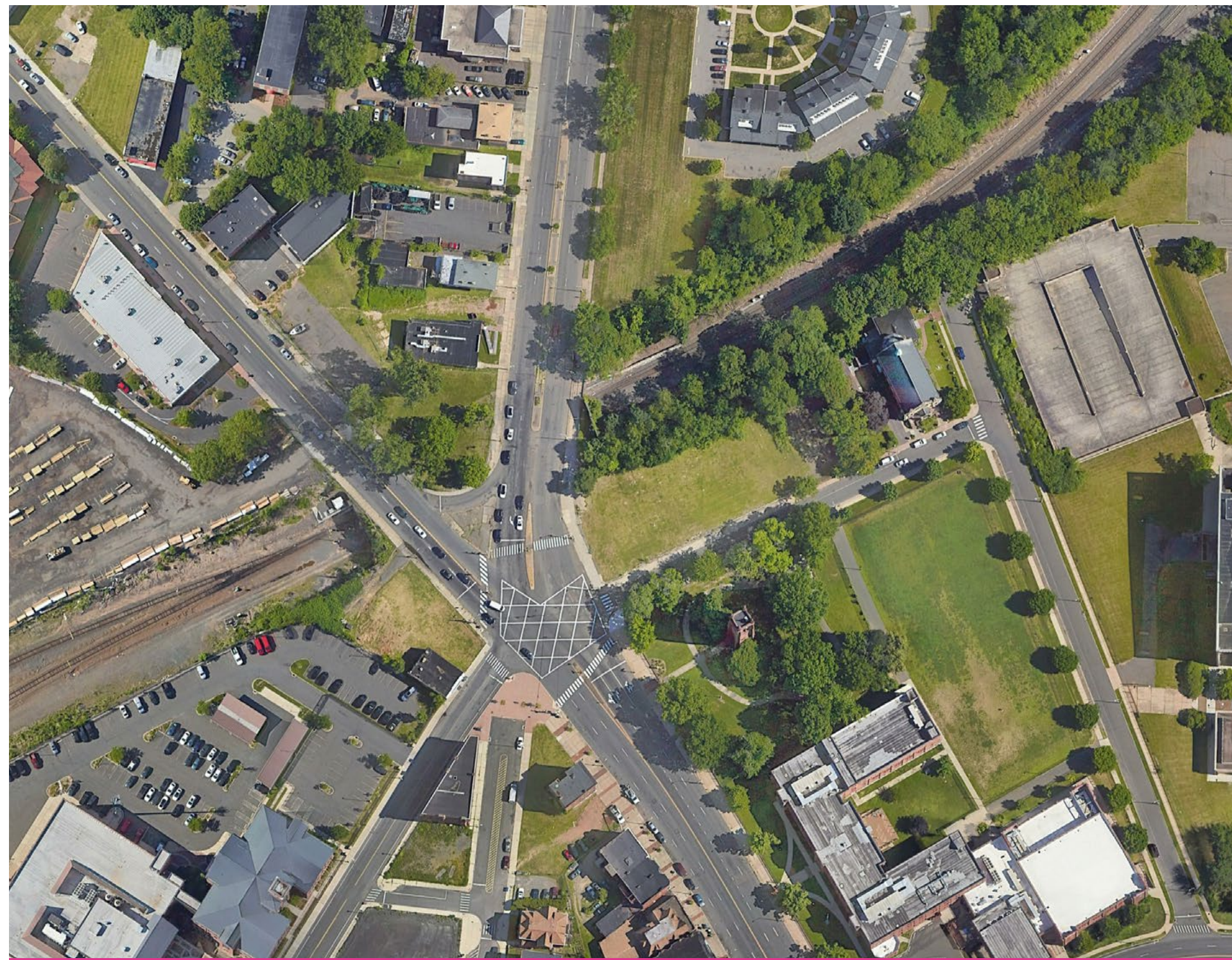
ALBANY AVE & MAIN STREET