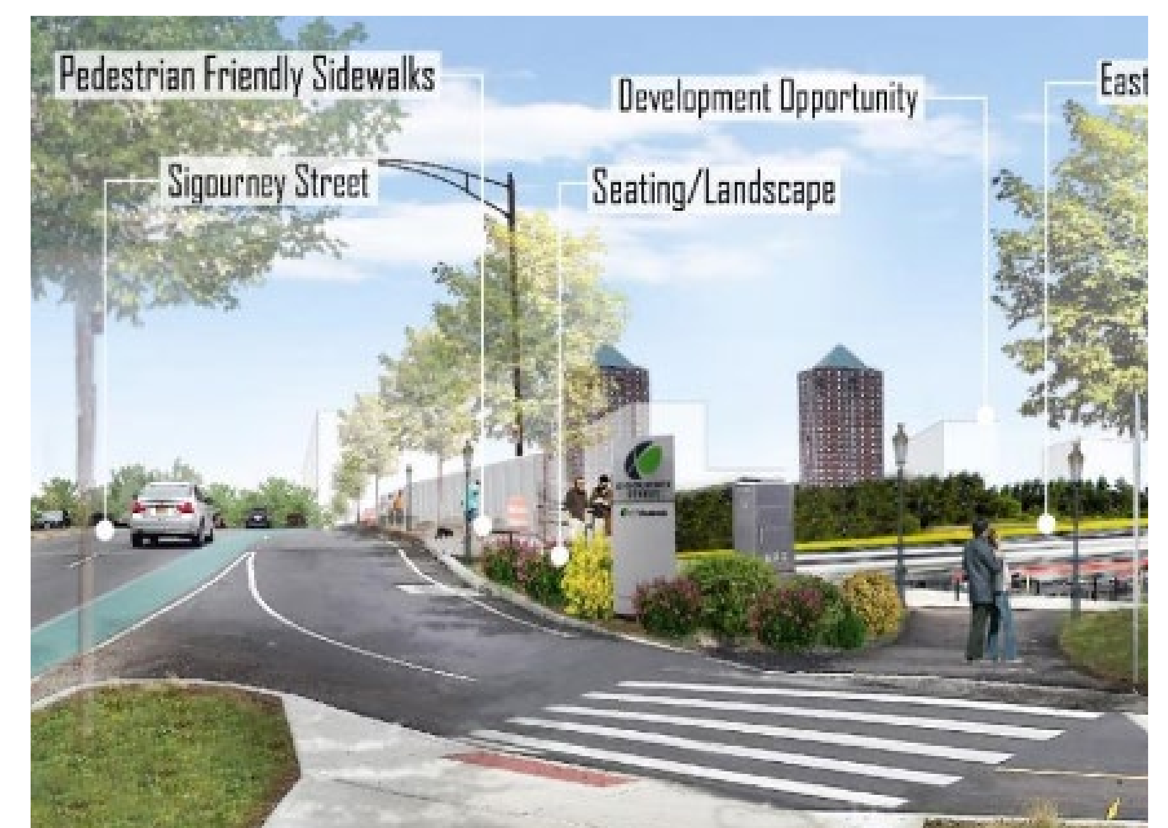
PEDESTRIAN ENHANCEMENTS AT RAMPS